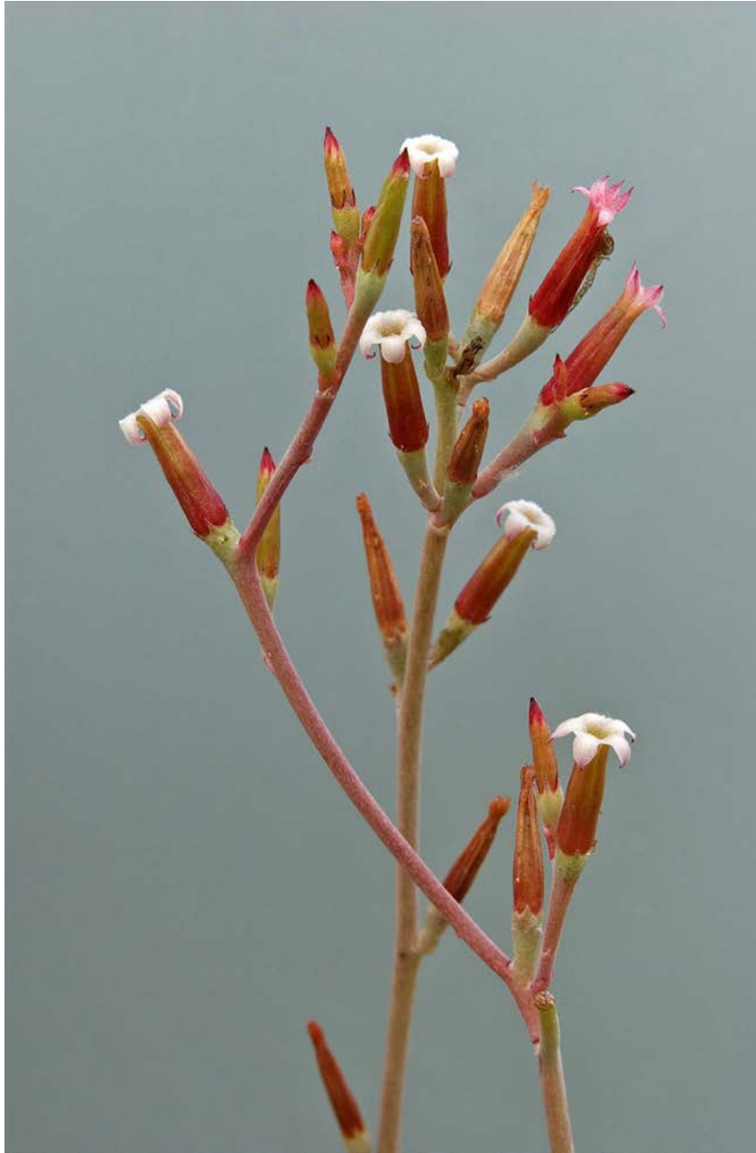
Fig. 4 Adromischus halesowensis inflorescence, 20-40cm long. Flowers 1.8-2.0cm long.