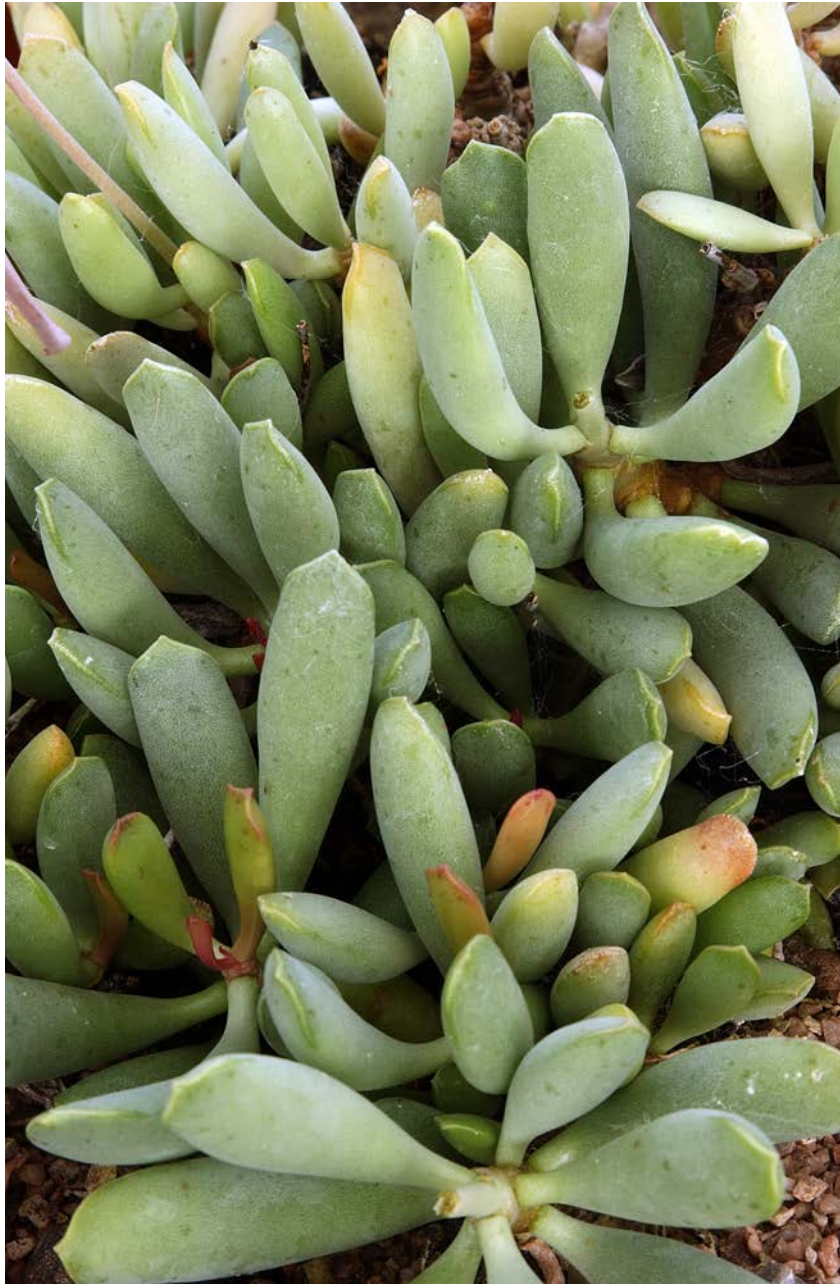
Fig. 3 Adromischus halesowensis in cultivation. Leaves to 5.7cm long, 1.5cm broad, 1.2cm thick.

Visitors to Halesowen report that A. cooperi is common there, but so far no one has seen A. halesowensis again since its first description. Land use in the area has changed significantly since 1931, where it may now have become extinct.